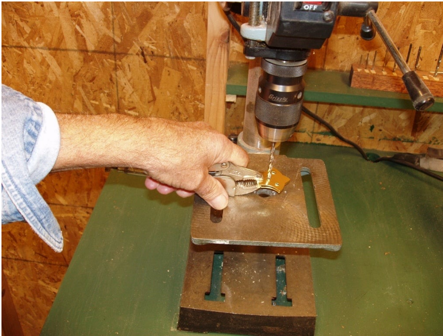
An accident waiting to happen