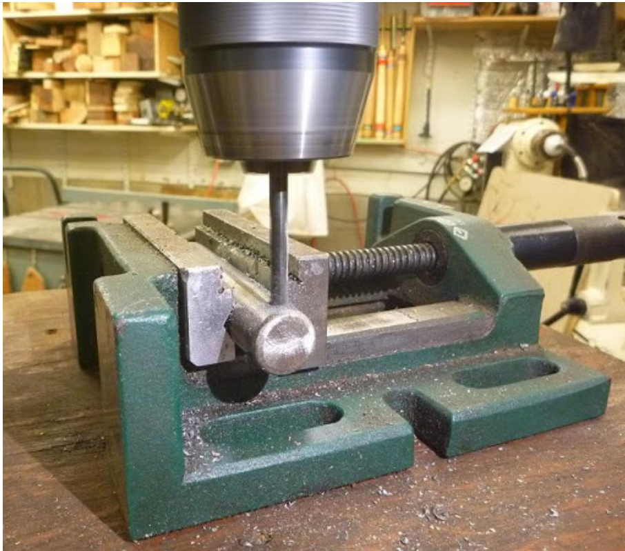
Work secured in an engineer's vice